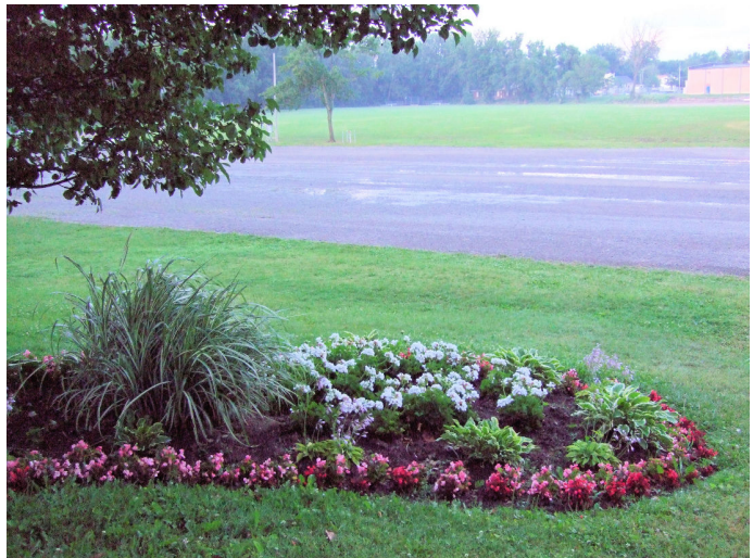
Flower bed at Faurot Park clubhouse