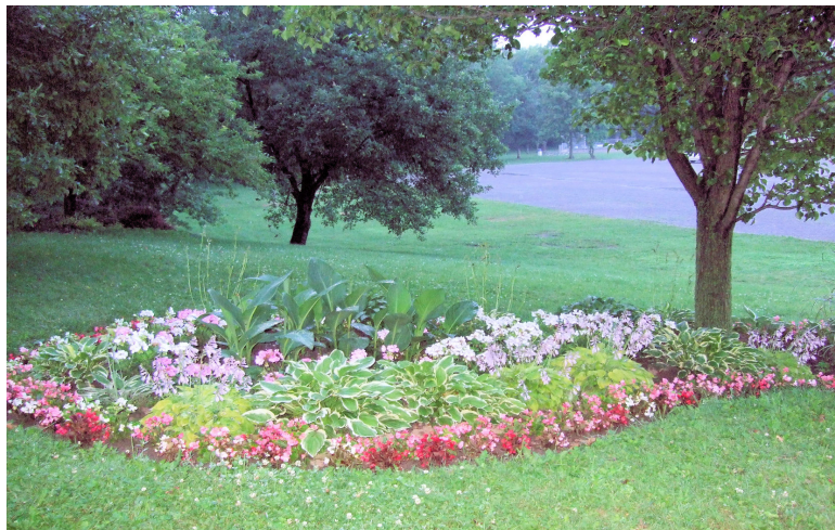
Flower bed at Faurot Park clubhouse