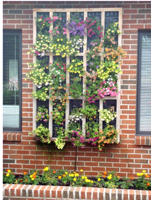
Wave petunias growing on the wall